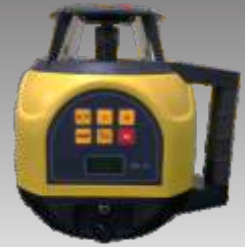
LASER TRANSMITTER - MRL 101