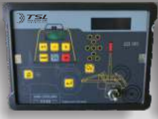
LASER RECEIVER - CLS 300